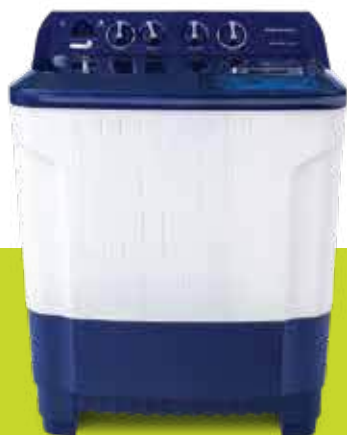
KWS-C700BL 7 KG