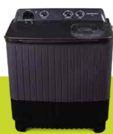
KWS-N70ERSKD 7 KG