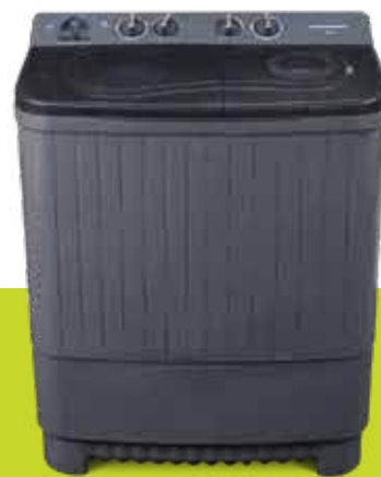
KWS-N80ERSKP 8 KG