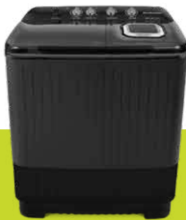
KWS-120DG 12 KG