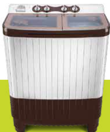
KWS-A850CB 8.5 KG