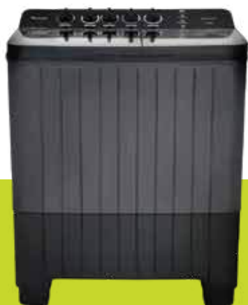
KWS-N14ETTKP 14 KG