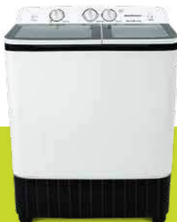
KWS-C700BK 7 KG