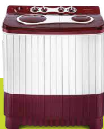
KWS-A800CR 8 KG