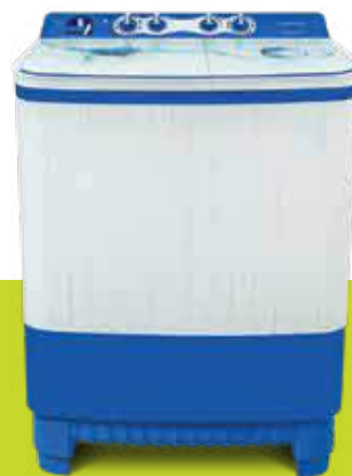
KWS-C900BL 9 KG