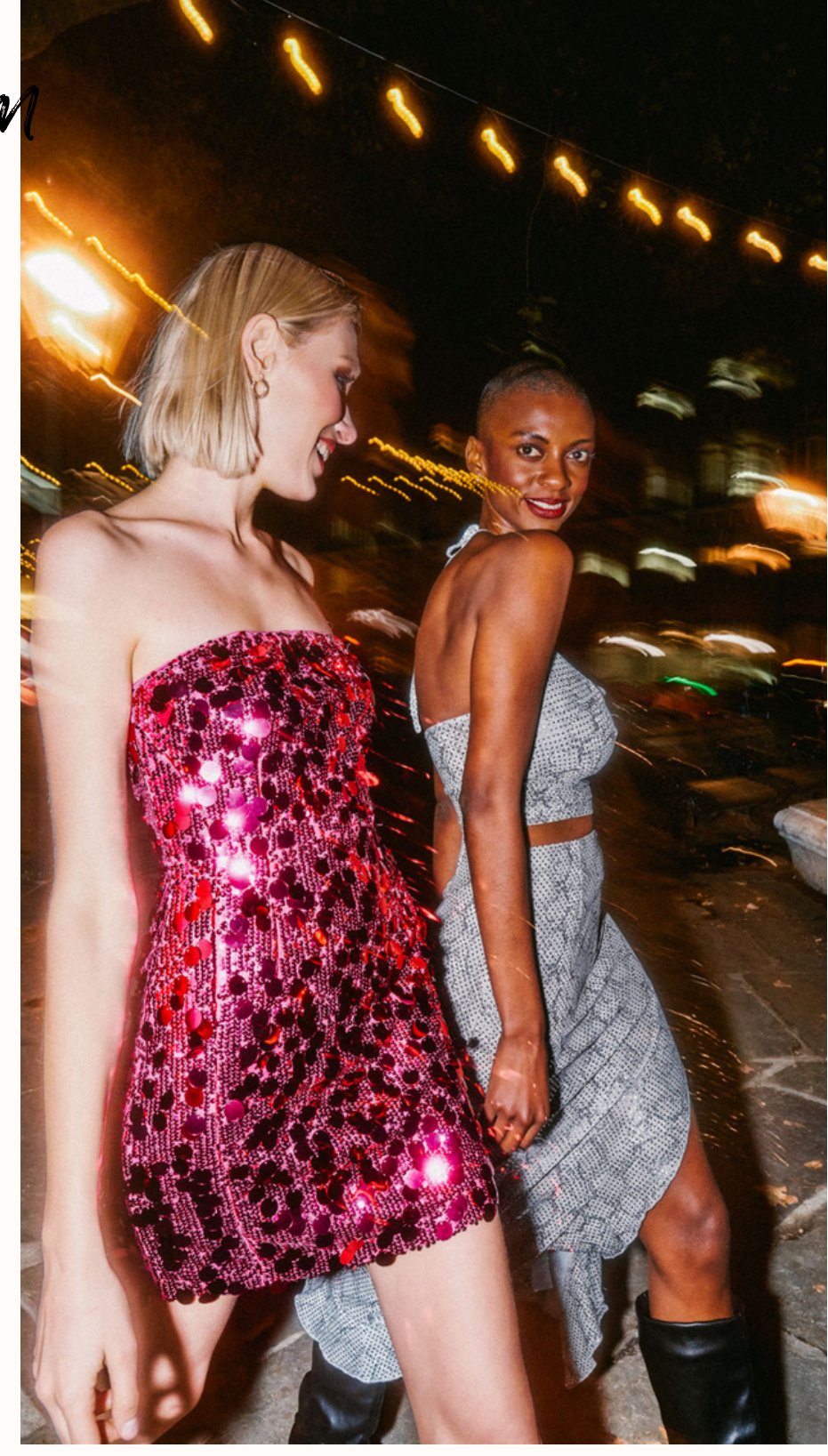
Pink Off ShoulderMini Dress With Sequin